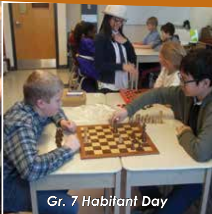
Gr. 7 Habitant Day