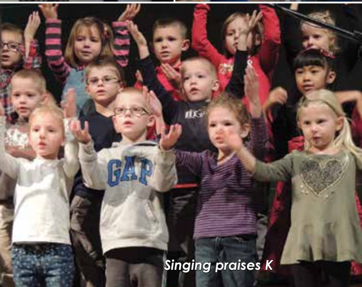
Singing praises K