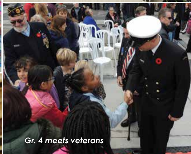
Gr. 4 meets veterans