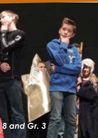
Gr. 3 and Gr. 3