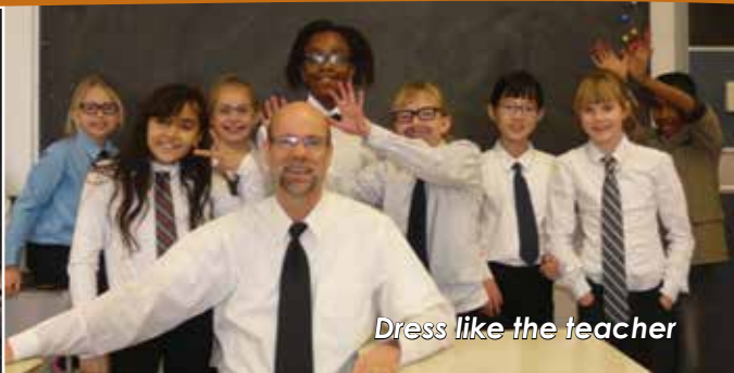
Dress like the teacher