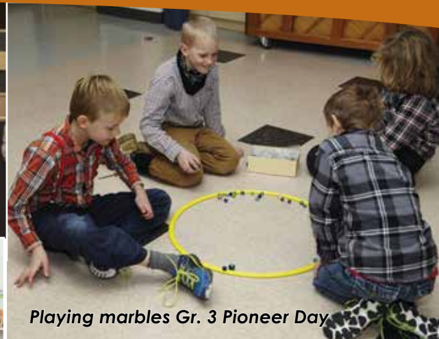
Playing marbles Gr. 3 Pioneer Day