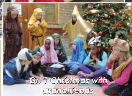
Gr. 1 Christmas with grandfriends