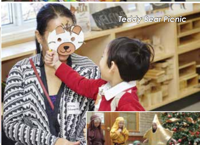
Teddy Bear Picnic