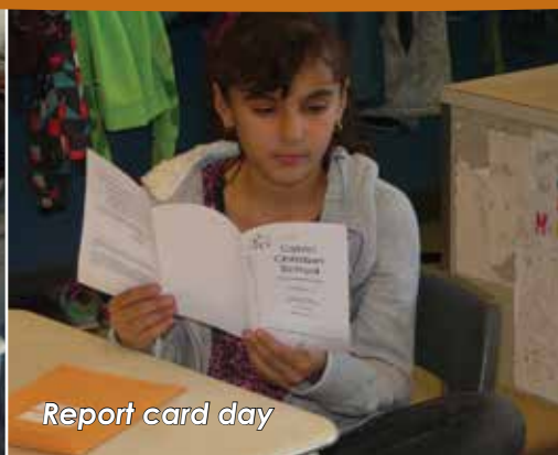
Report card day