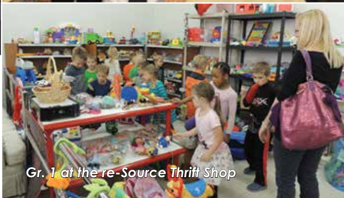
Gr. 1 at the re-Source Thrift Shop