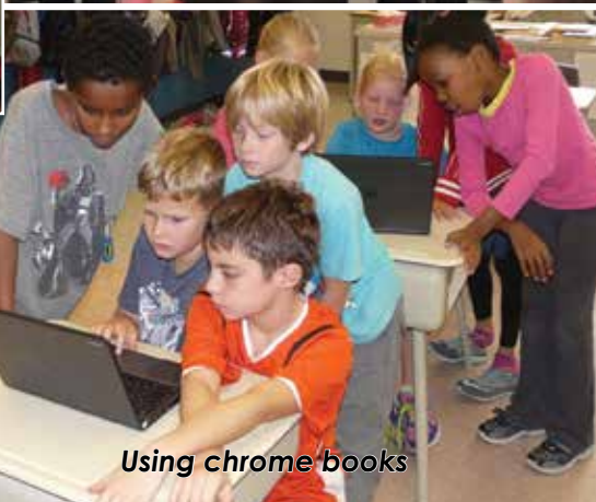
Using chrome books