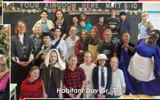
Habitant Day Gr. 7