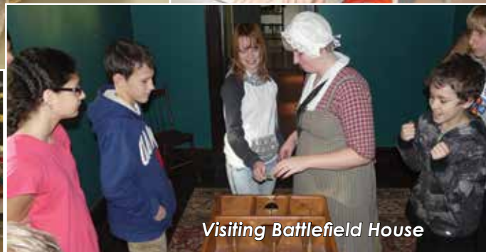
Visiting Battlefield House