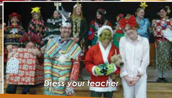
Dress your teacher