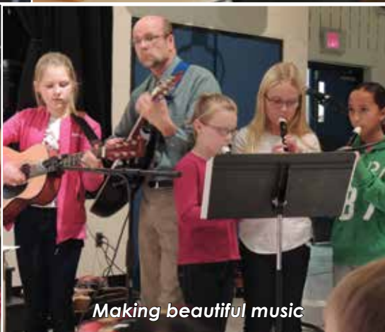
Making beautiful music