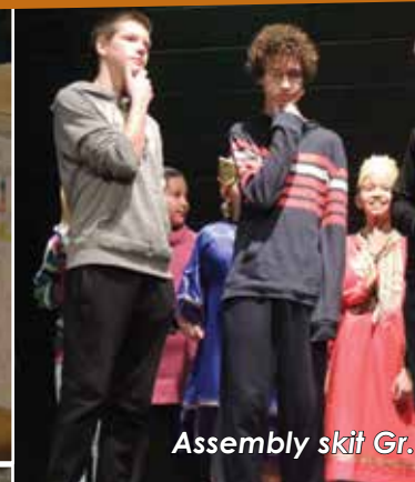
Assembly skit Gr.