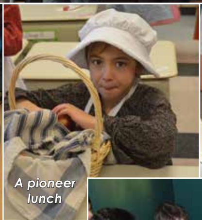
A pioneer lunch