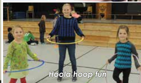
Hoola hoop fun