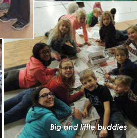
Big and little buddies