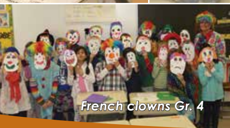
French clowns Gr. 4