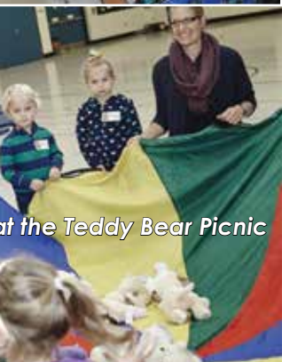
at the Teddy Bear Picnic