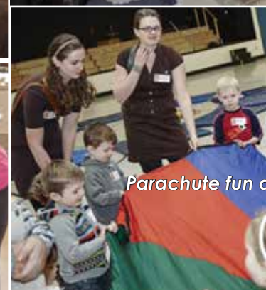
Parachute fun c